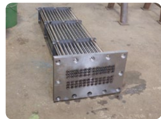
Tank heater bundle