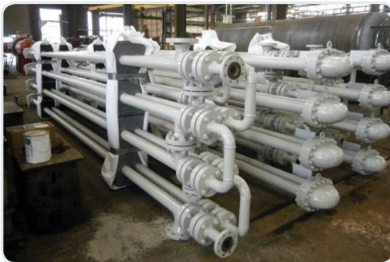
Pipe in pipe exchangers