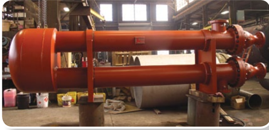
Hair pin exchanger