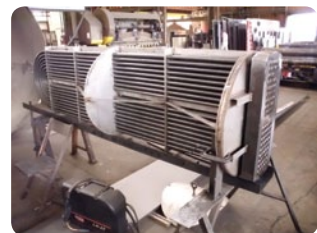
Tail gas heater - U-30-084 BEU