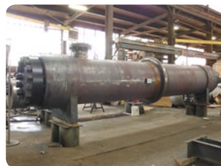
FS-40-192 Type DED