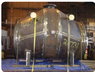
Eccentric Heat Exchanger