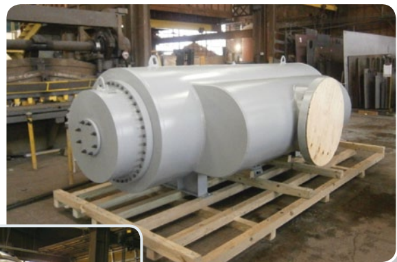
49-140 BXM Intercooler