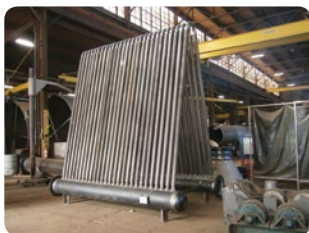
Replacement CA-40 Van-Air Dryer